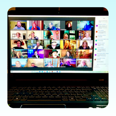
Volunteer Meeting Online!