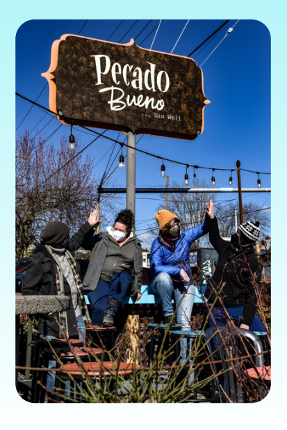
High fives for meeting outdoors in the cold!