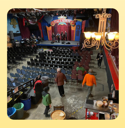
Things are almost ready...